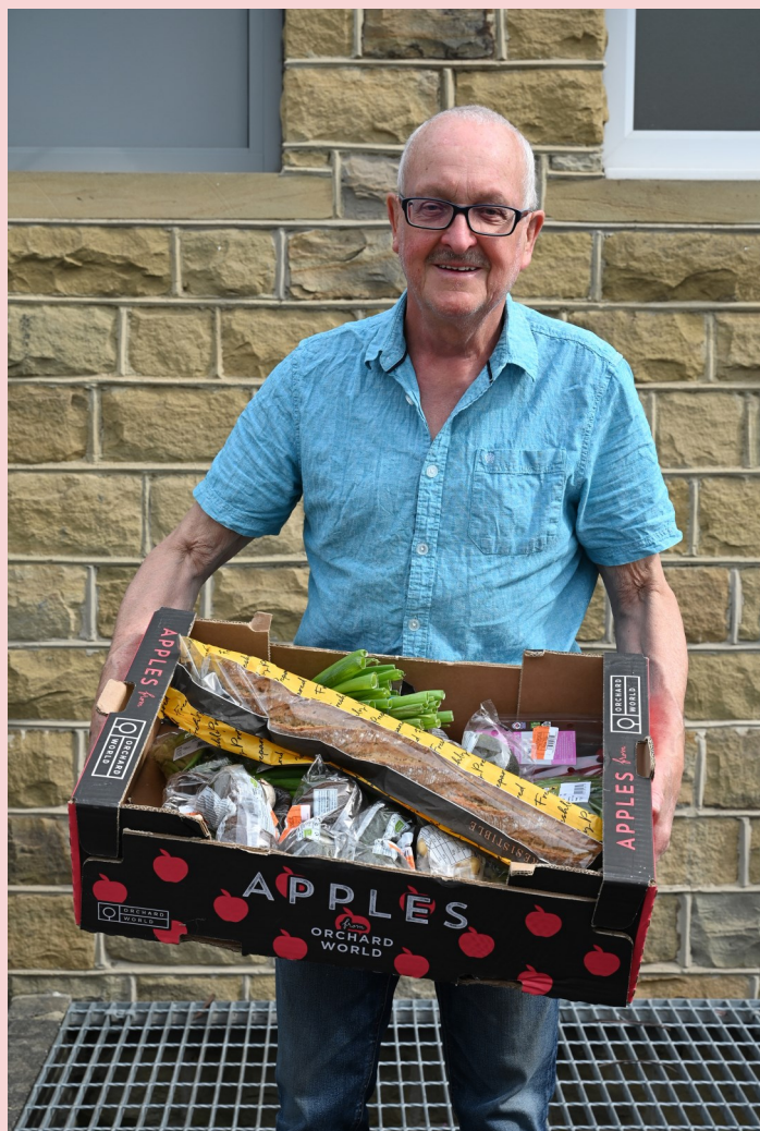
Part of the regular donation of food from the Millbridge Co-op

Cleckheaton Methodist Church in whose premises we operate has been unstintingly generous. They allow us the use of our space free of charge and support us with friendship always.